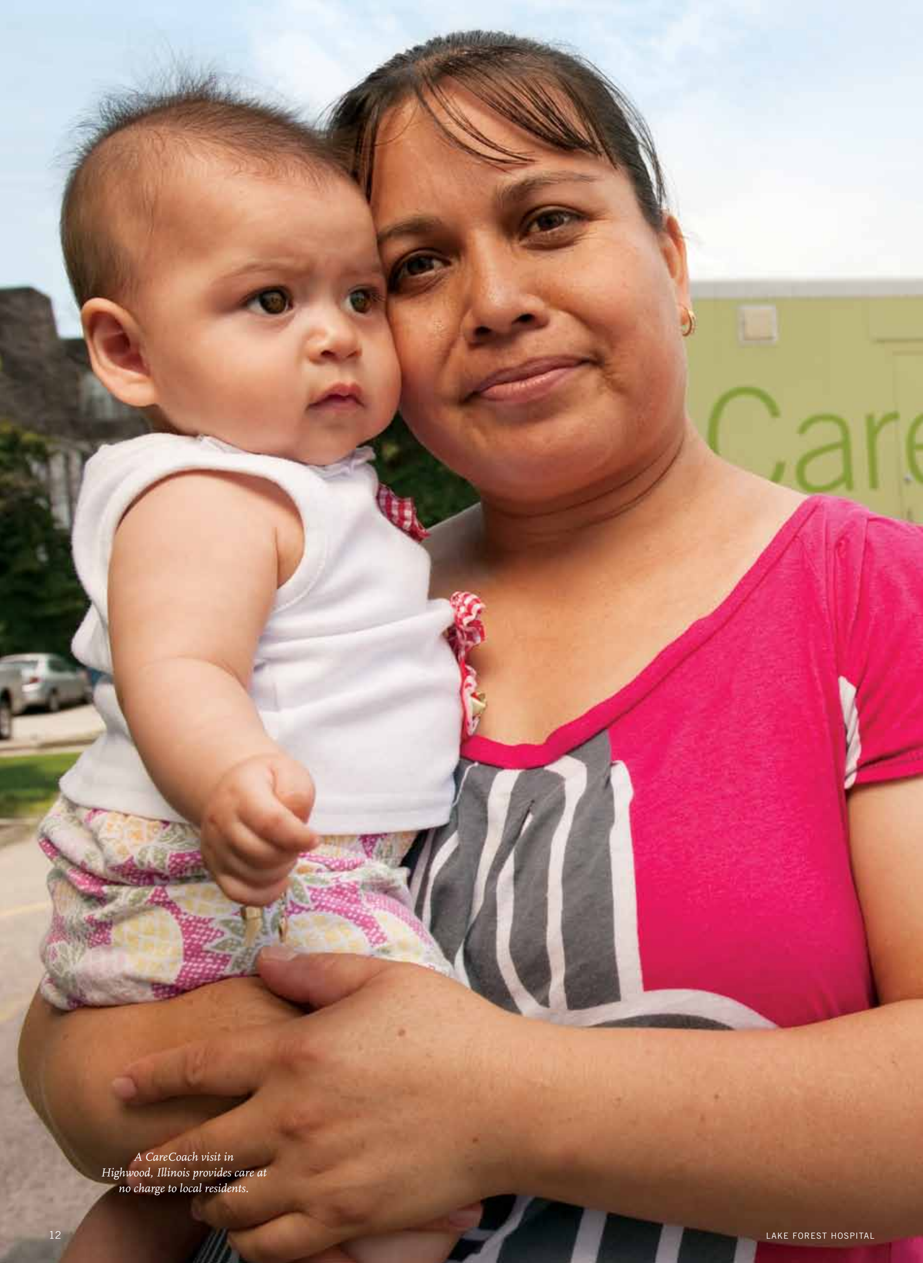
A CareCoach visit in Highwood, Illinois provides care at no charge to local residents.